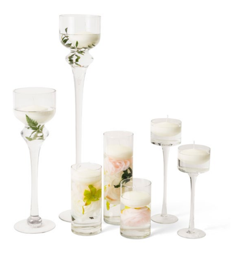
Glass Cylinder Vases Available in varying heights and sizes.